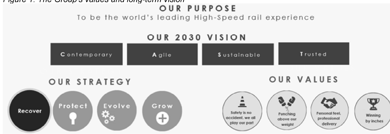
Figure 1: The Group's values and long-term vision

The strategy is underpinned by a set of values and core delivery work streams.