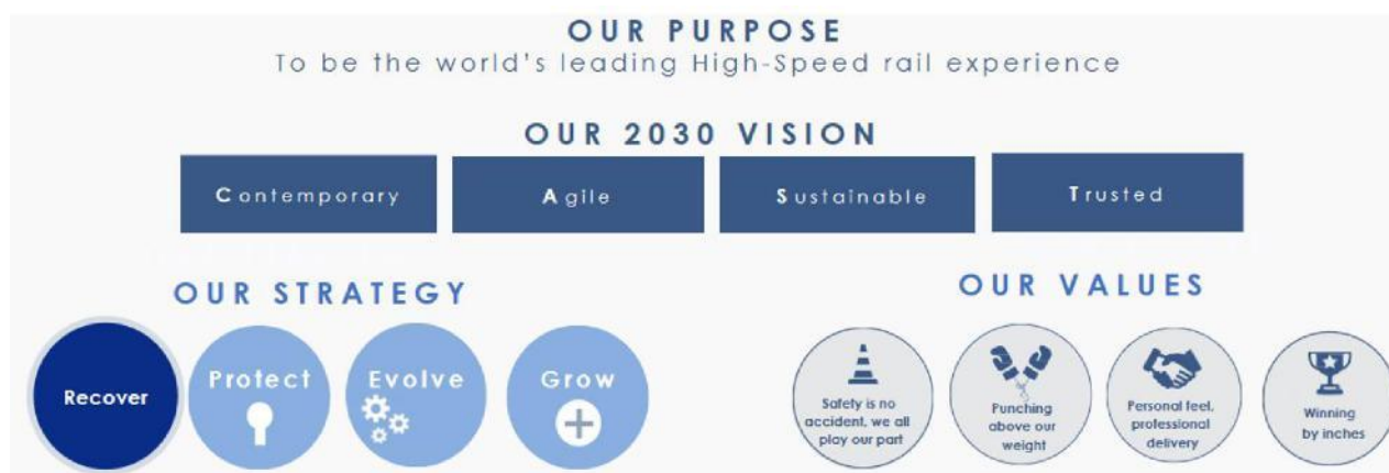
Figure 1: The Group's values and long-term vision

The strategy is underpinned by a set of values and core delivery work streams.